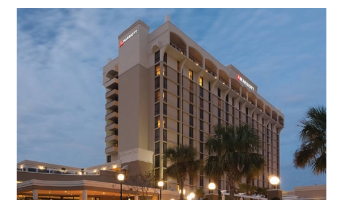
CHARLESTON MARRIOTT Charleston, S.C. | October 4-6, 2021